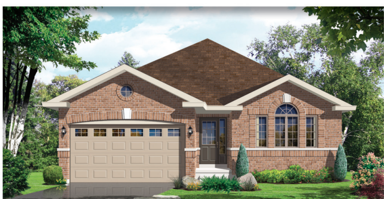
Elevation -A-1220 sq.ft.