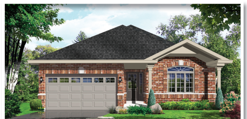
Elevation -C-1220 sq.ft.