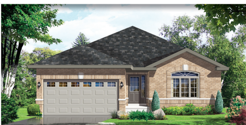
Elevation -B-1220 sq.ft.